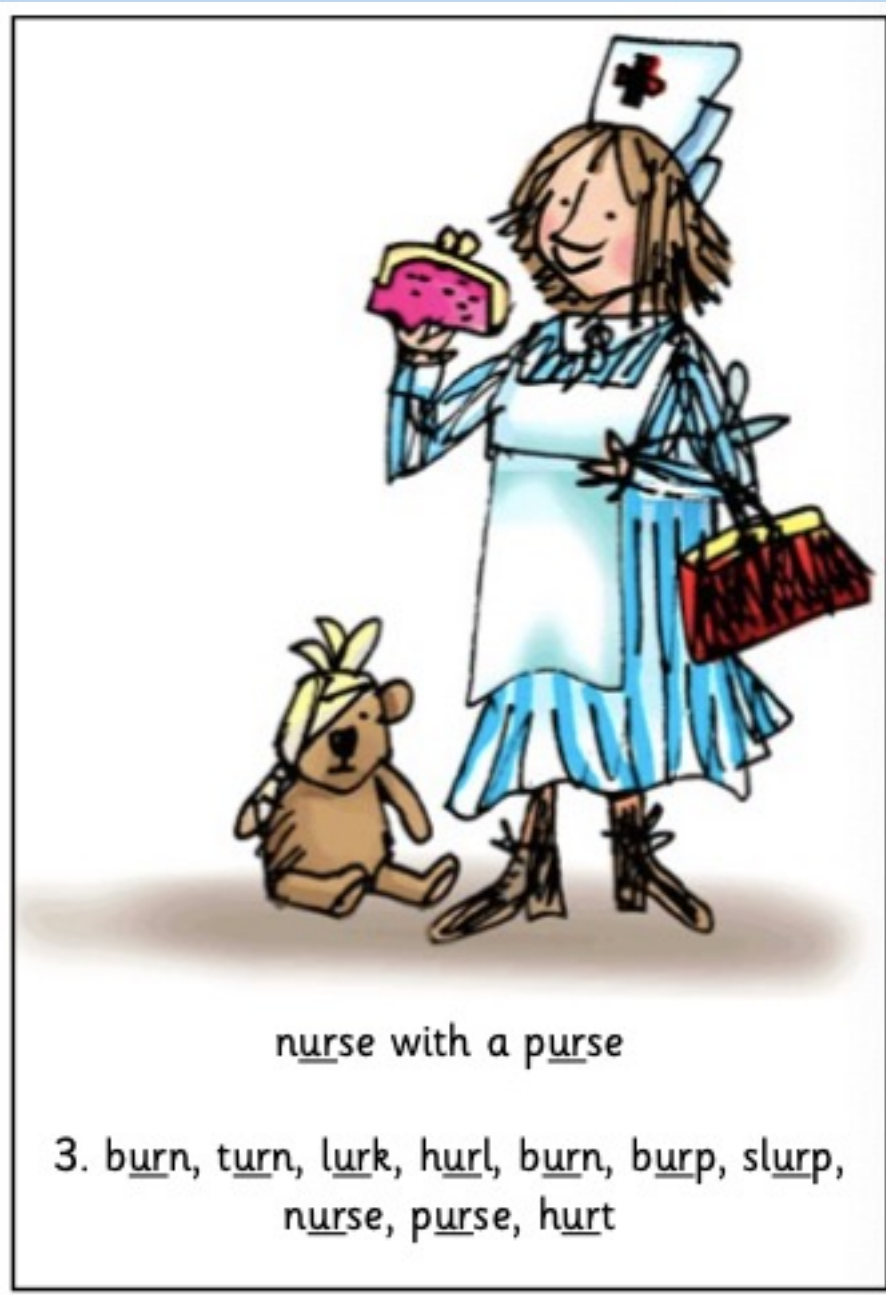
nurse with a purse

3. burn , turn , lurk , hurl , burn , burp , slurp , nurse , purse , hurt