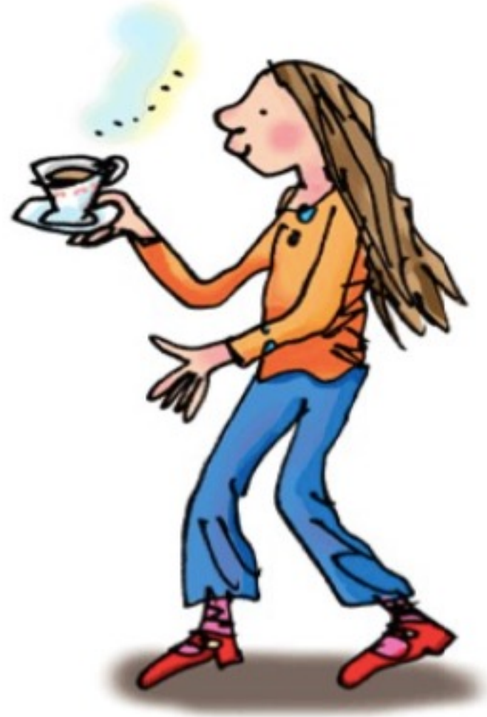
cup of tea

3. ea t, tea , nea t, rea l, clea n, plea se, lea ve, dream , sea t, screa m