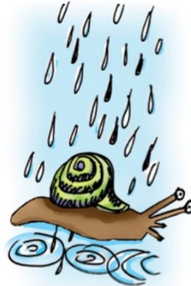
sn ai l in the r ai n

3. p ai d, sn ai l, t ai l, dr ai n, p ai nt, Sp ai n, ch ai n, tr ai n, r ai n, st ai n